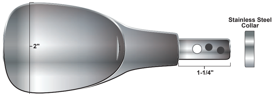
Diagram A - Parts and Assembly