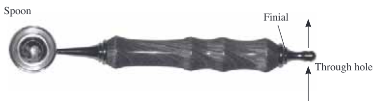
Diagram D / Bushings #PKMSPNBU